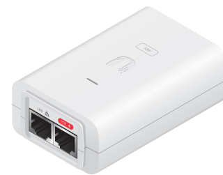
POE-24-24W-G-WH POE-48-24W-WH POE-48-24W-G-WH