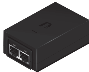
POE-24-24W POE-24-24W-G POE-24-30W