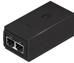
POE-15-12W POE-24-12W POE-24-12W-G